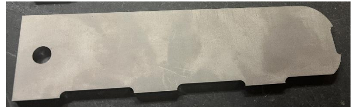
Coating Insert for sliding surfaces of slide chairs

This NEW coating insert can be applied on a wide variety of existing slide baseplates such as cast-iron, construction steel and carbon steel to bring these benefits to either new slides or as a solution for refurbished baseplates.